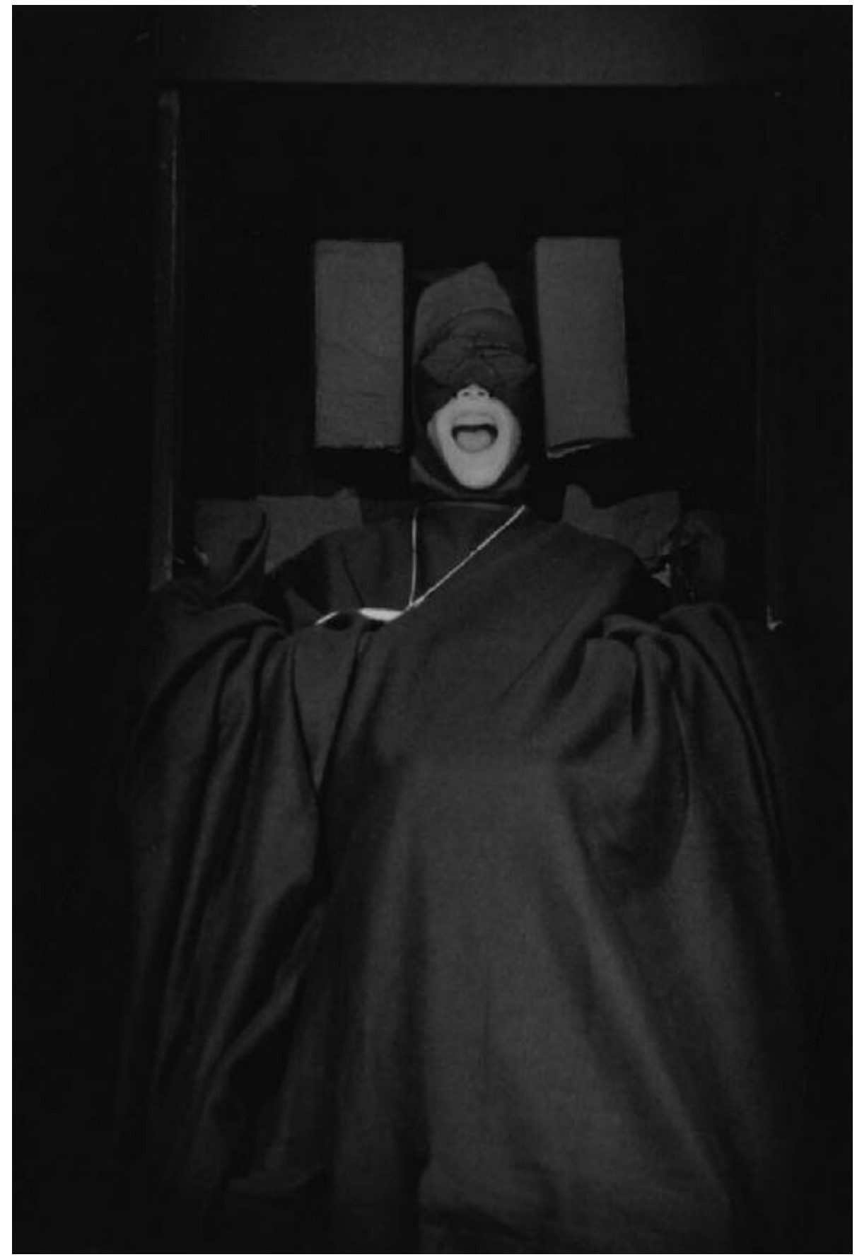
Billie Whitelaw in rehearsal for the Anthony Page production of "Not I" in 1973 The rostrum clamps to steady the head to stage an image of the floating mouth in darkness